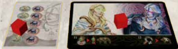
EXAMPLE 1. The red player put his first clan member on an

The Clan Members can be placed on any action card. When a player place his first Clan Member on a card he gets 2 Devotion Power (DP) on the associated temple card (light or darkness, his choice);